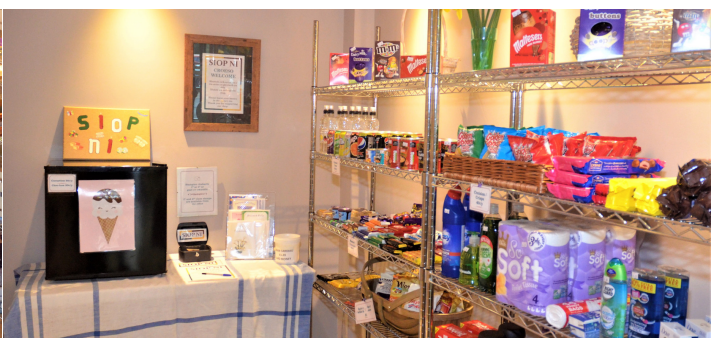
Pictured: Siop Ni open for business