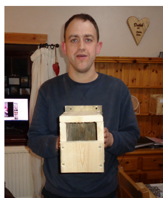
Pictured: Crafty Guest

We have been lucky enough to receive donations of wood and other bits from the community in order to get started - special thanks to Huws Grey. If anyone feels they may need any of these items we hope they will be available to order soon.