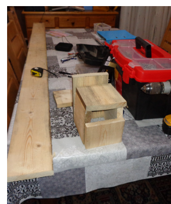
Pictured: Squirrel Boxes

It makes me feel good that we are providing an environment where the wildlife can thrive, with the involvement of the guests we support. It's great that the people we support get to see the outcome of their contributions - it started with one person being involved, which encouraged more and more people to get involved.