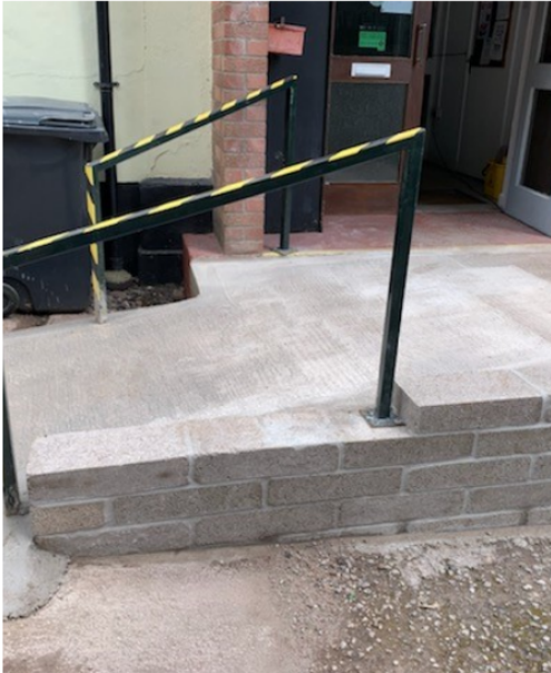
Pictured: Testing out the new ramp

Thank you to Robert Price BM for their generous donation of materials to allow members of Cartrefi in Pontypool to improve the access to their much loved local social club.