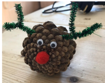
Pictured: Cone decorations