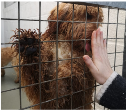
Pictured: He's looking for a home

Visit https://www.manytearsrescue.org/index.php to find out how you can help too!