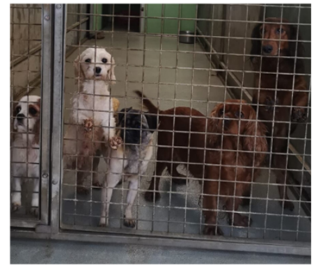
Pictured: Ex-breeding dogs