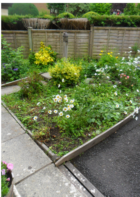
Pictured: Nae's Garden

Nae from Builth Wells has worked very hard and explains what she has done in her garden: "First of all, I got all the weeds out of the garden then I put all the garden waste in a rubbish bag. I also bought garden flowers and planted them into pots also bought garden ornaments to put them into the flowerpots and now they look nice and tidy in the pots. I am quite pleased with my garden and I hope you agree that now it looks a very smart garden."