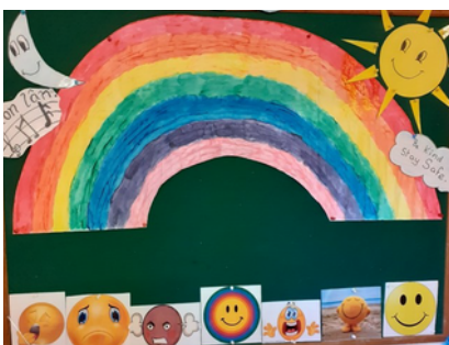
Pictured: Pen Dyffryn Rainbow