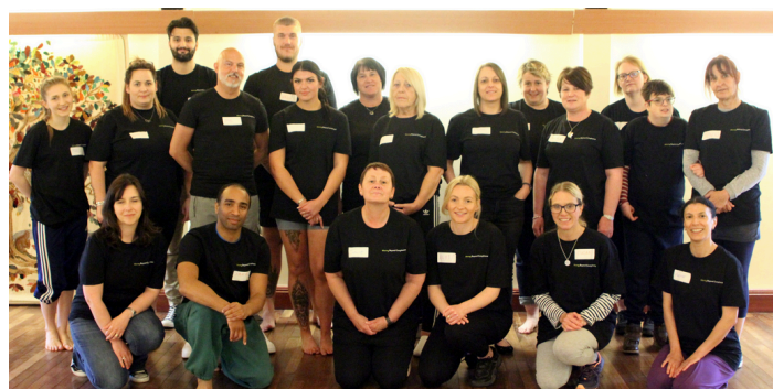
Pictured: Participants at the first workshop

Since our partnership with National Dance Company started, we have been working together to plan a way in which both organisations can come together to benefit Cartrefi staff. The decision was made to create a pilot project that would focus on the wellbeing of support staff, who continue to work tirelessly to support people to live independently, even throughout the pressures of the pandemic.