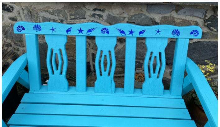
Pictured : Newly painted bench