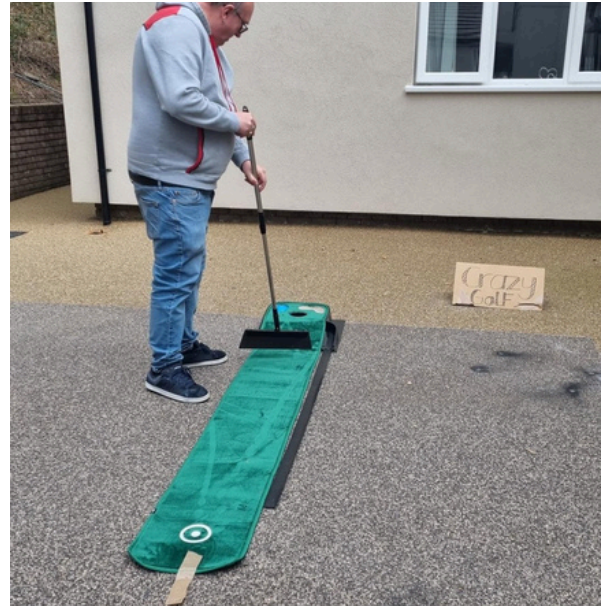
Pictured : The garden golf course