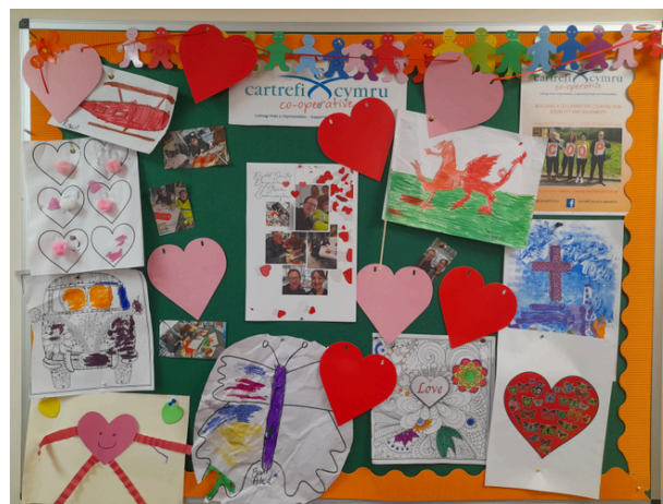
Pictured: Artwork created in the Forum