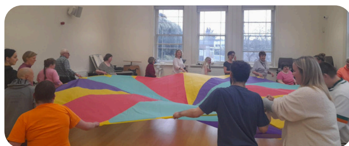
Pictured: A Friendly game of parachute