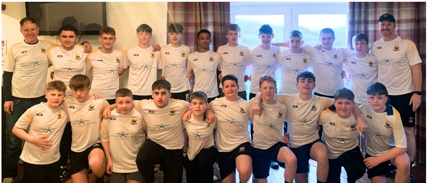
Pictured: Maesteg Celtics Under 14s Team

We wish the Maesteg Celtics all the best of luck!