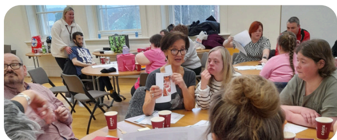
Pictured: Everybody who took part in the group discussion

The day then ended on a high by unrolling and taking part in some games using a 20-foot parachute which reiterated how important teamwork is!